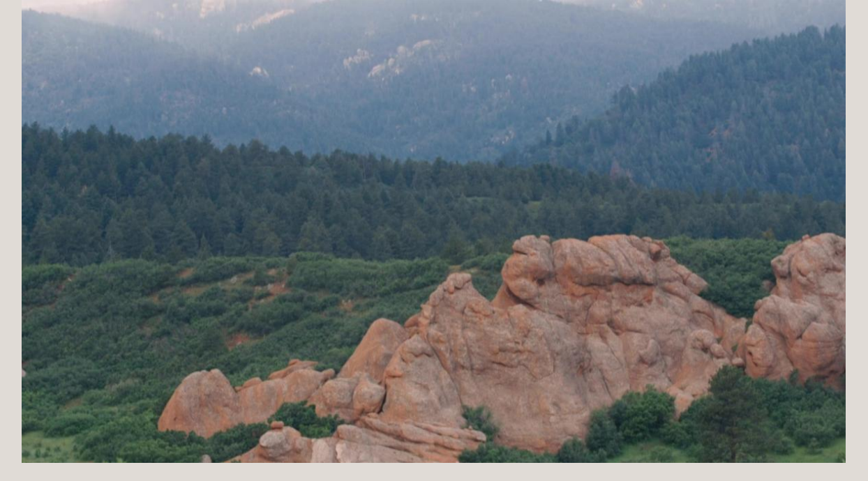
View of Sandstone Ranch - Pike National Forest in the background.

The opportunity to protect this important piece of Douglas County's history was almost lost. In 2006, Sandstone Ranch was purchased with the intention of turning it into a 114-home development. The plan was later abandoned, and Sandstone Ranch found itself back on the market in 2017.