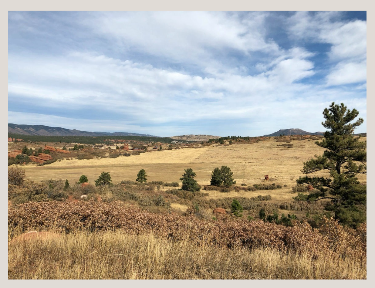
View from a high point within Sandstone Ranch. Very few open vistas like this one are left along the Front Range.

In January 2018, Douglas County purchased Sandstone Ranch for $18.75 million, in large part with sales and use tax revenue from the 1994 voter-approved Douglas County Open Space Fund. Such revenues are exclusively dedicated to the protection of open space as well as for funding County parks. CRMC provided $6 million to Douglas County to protect certain portions of the ranch to achieve the environmental credits CRMC needed in association with the CSRP.