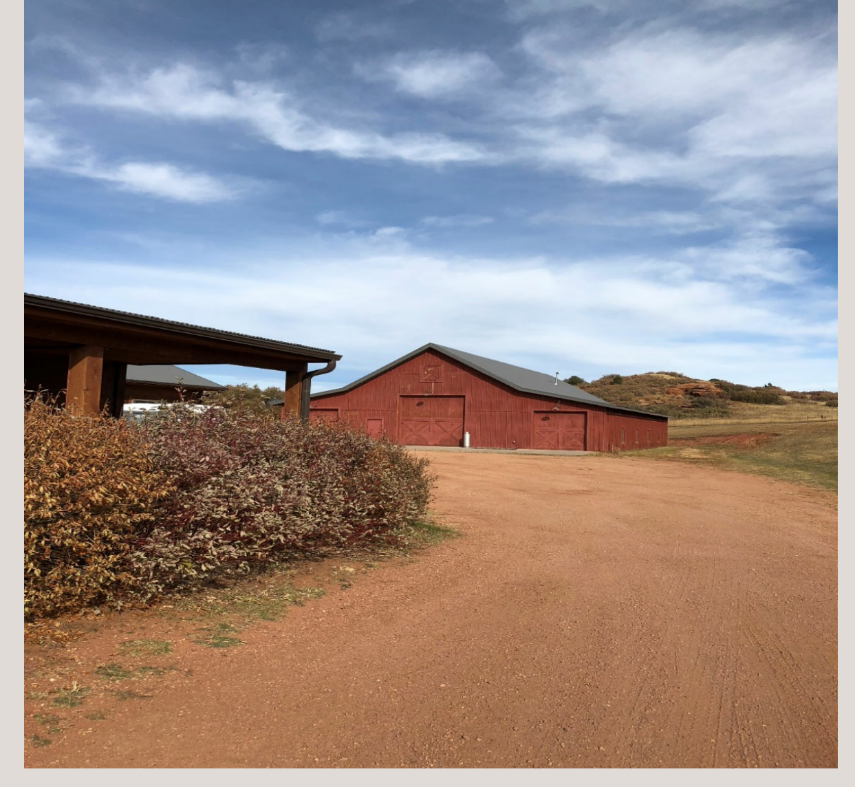
Sandstone Ranch has been a working ranch since the late 1800s.

Sandstone Ranch is a historic 2,038-acre property, intersected by West Plum Creek and Gove Creek near Larkspur, Colorado. The property shares 3.5 miles of its western border with Pike National Forest. Sandstone Ranch is known to be one of the oldest working ranches within Colorado, operating for more than 150 years. Along with several preserved buildings dating back to the 1870s, the property also features diverse landscape and habitat features including red rock formations, meadows, and lush riparian corridors, which provide for abundant wildlife and vegetation resources.