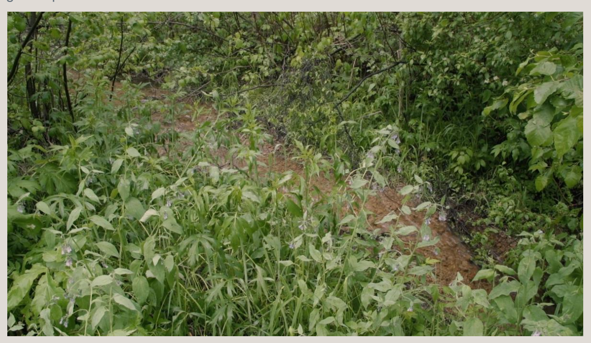
A view of a protected area along West Plum Creek on Sandstone Ranch.

The protected portions of Sandstone Ranch for CRMC's off-site mitigation features a rich riparian corridor. It provides expansive nesting, roosting, and foraging areas along the North American Central Flyway, which is critical to migratory birds - many of which have also been seen at Chatfield Reservoir. Since April 2018, more than 130 bird species have been documented at the ranch. The protected portions also preserve valuable habitat for cottonwoods and Preble's meadow jumping mouse as well as serves as a wildlife corridor for game species.