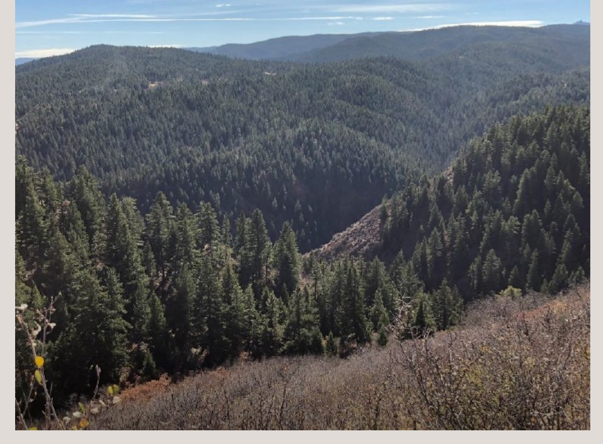
View from Schmidt Property's northern parcel.

In late 2017, the Schmidt Construction Company graciously donated the property to Douglas County. Originally purchased by Schmidt Construction as a potential source for extracting gravel materials, the heavily wooded and steep terrain proved to be ill-suited for that purpose. The property has been wholly undeveloped, with limited to no recreational use for at least the last few decades. Due in large part to the property's remoteness, Schmidt Property contains a number of natural resources pertinent to CRMC's environmental mitigation needs, including bird and Preble's meadow jumping mouse habitat, as well as wetlands.