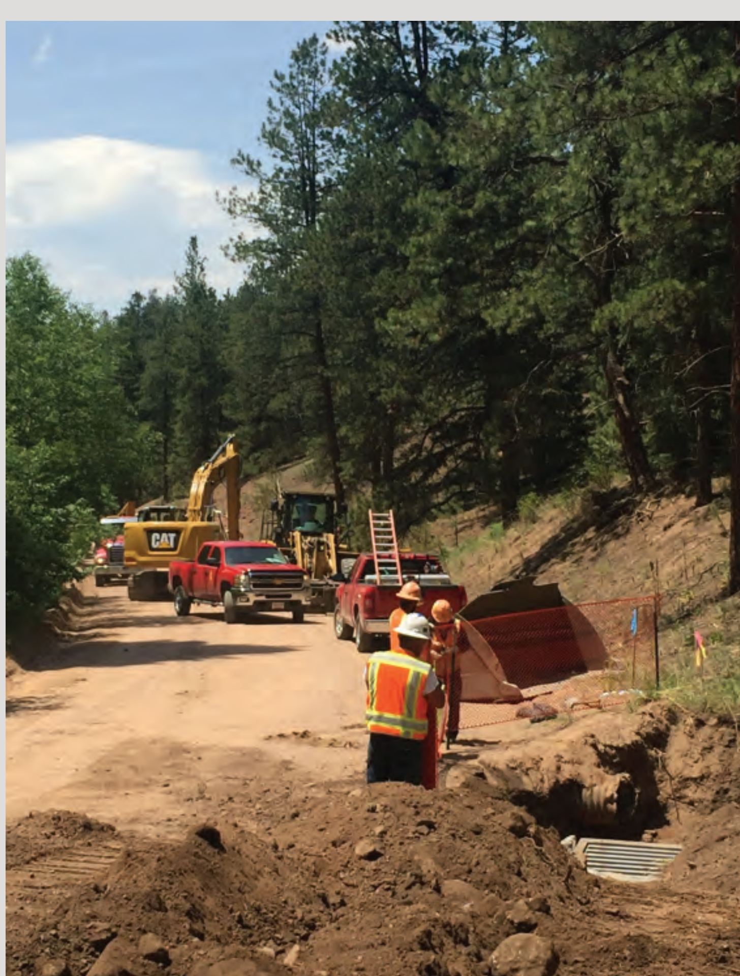
in the Sugar Creek drainage.

CRMC Construction Manager Tim Feehan indicated that "construction has begun for phase 2 of the Sugar Creek environmental work", which will occur over a two- to threemonth period until it's completed.