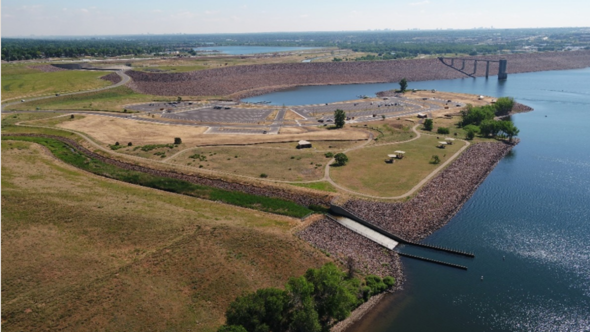
North Boat Ramp following construction that was completed in June 2018.