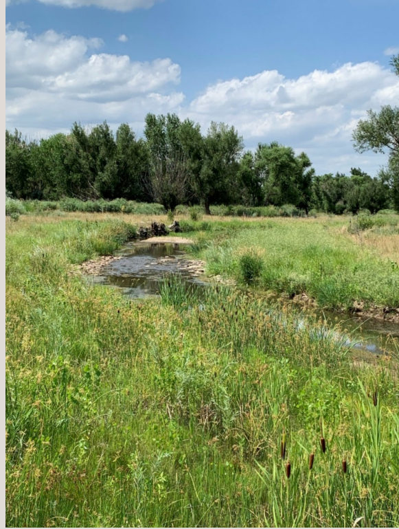
Plum Creek channel showing improved health in early 2020

Once significant water storage occurs in the reallocation pool, additional activities such as tree flagging and removal, may occur as part of the Adaptive Tree Management Plan .