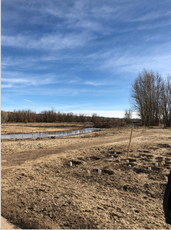
Plantings along the restored Plum Creek channel in 2018.