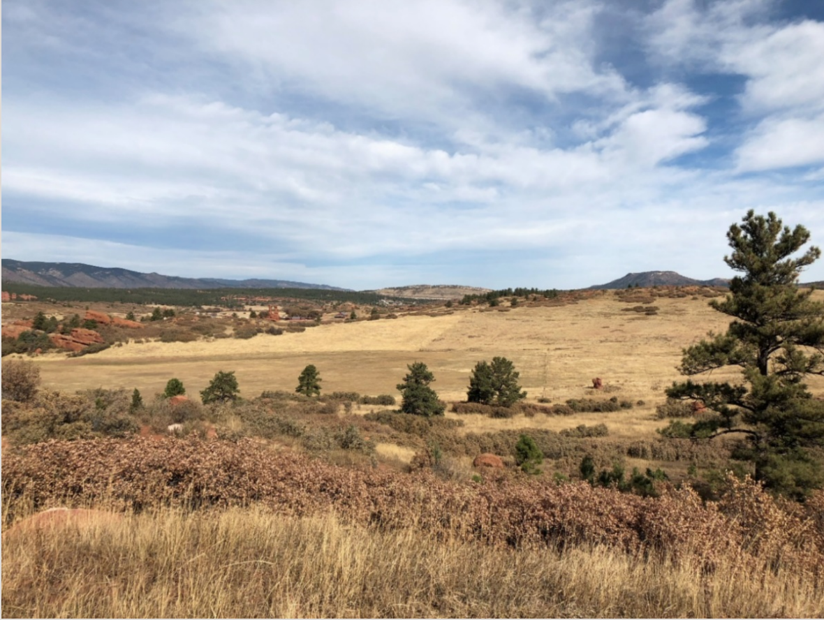
View from a high point within Sandstone Ranch. Very few open vistas like this one are left along the Front Range.