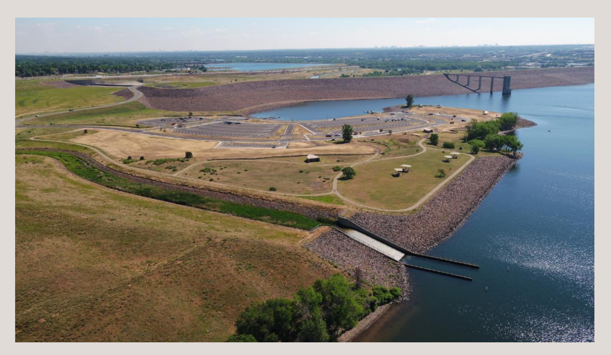
North Boat Ramp following construction that was completed in June 2018.

The Project Participants formed the Chatfield Reservoir Mitigation Company (CRMC) to oversee the design and implementation of the recreational modifications and environmental mitigation.