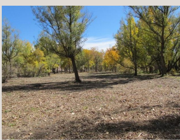
Before and after pictures of tree thinning and forest floor clean-up along Plum Creek.